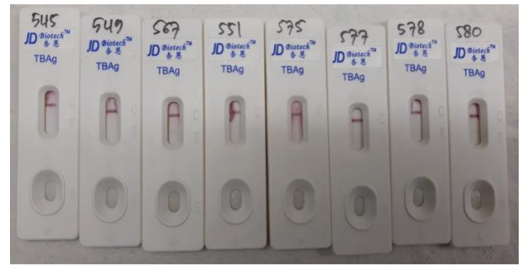
Figure 2. Results of antigen examination with ICT (Cocktail Antigen) TB

A limitation of this study is the difficulty in collecting homogeneous samples (samples that are purulent). Besides, further research needs to done by using samples of TB suspects patients not only for AFB examination but also using culture/culture samples so that the bias results are more accurate.